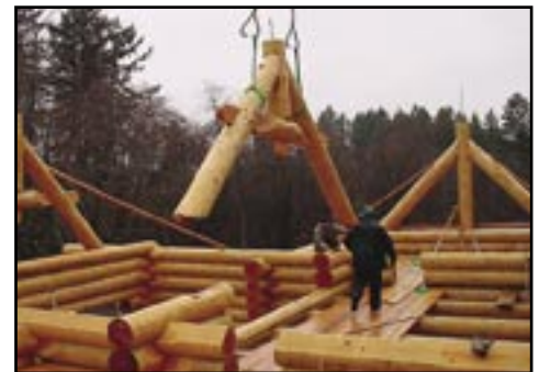
Mark Fritch Log Homes

Log builders frequently also use bleaches, brighteners and cleaners, all of which are intended to improve the appearance of wood. Because their purpose is not to protect against pests, these products are not subject to PMRA pesticide regulations. However, workplace safety requirements do apply – see the section on wood cleaners.