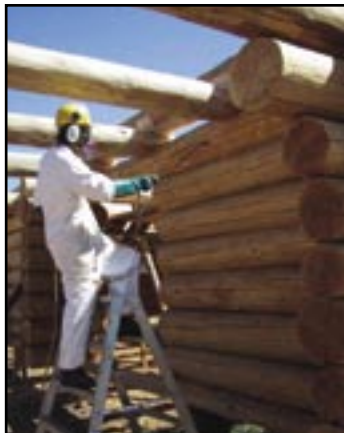
Nicola Logworks Limited

In sawmills, sapstain control products are usually sprayed on lumber, but can be applied by dipping as well. On logs they would be most effective when ap-