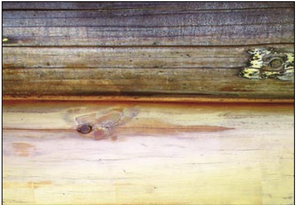
Canadian Building Restoration Products Inc.

Insects that can eat logs or make their homes in wood are of special