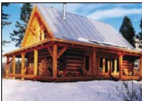
Nicola Logworks Limited/Nicola Logworks Design