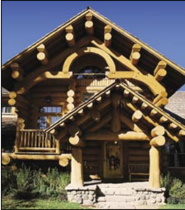
Unique Timber Corp. / EDG Architects