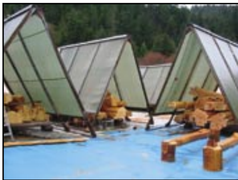
West Coast Log Homes

Many builders prefer to harvest logs in late fall or winter to reduce fungal and insect problems. In the winter, the sapwood has low levels of nutrients (sugars and starches), which would otherwise encourage fungal growth. Also, bark beetles are dormant in winter. Some builders feel that an additional advantage to winter felling is the possibility of less checking, due to a belief that the initial moisture content (MC) of the tree is lower in winter than in summer and there is less difference in MC from heartwood to sapwood. Actually, the tree's MC is lower in the summer due to heavy demand by the needles for water. But this has no relevance, as checking only occurs when parts of the log get below the fiber saturation point (FSP), and the live tree's MC is far above FSP in all seasons. However, one wintertime factor can have a beneficial effect on checking. Slower evaporation in cold winter weather can reduce the drying stresses inside the log, which can reduce checking.