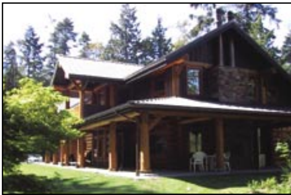
Nicola Logworks Limited / Sortun-VOS Architects