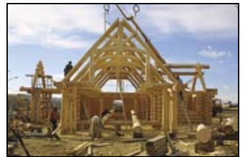
Moose Mountain Log Homes Inc.

In order to protect the logs from dirt or iron stain, some log home exporters use plastic liners when shipping by container. Some builders also find dried logs stay cleaner during shipping if they are first given a base coat of finish.