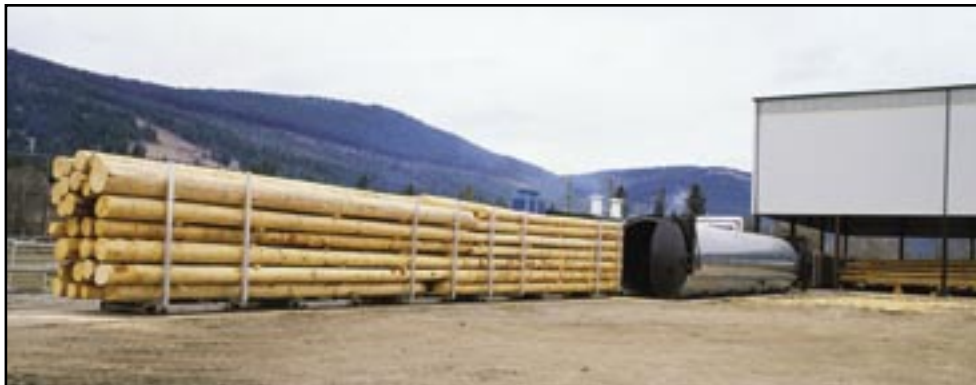
Unique Timber Corp.

One manufacturer's approach to safe storage of logs in a wet climate includes protection from rain, ground moisture and ultraviolet exposure.