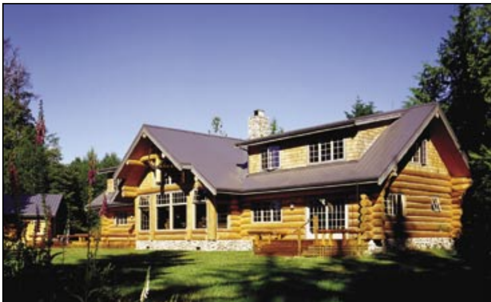
Whitevalley Log Homes/Jean Steinbrecher Architects

A simple wrap-around covered porch provides good wall protection.