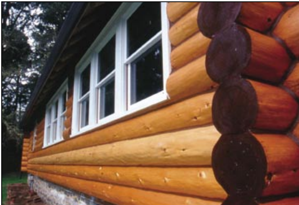
Restoration: David Rogers, Logs & Timbers.

This restoration of a historic 1937 building required extensive repairs and refinishing. It's far better and easier to maintain a building in the first place than to face an expensive restoration later. The log rot would have been prevented by borate rods, if they were available at the time the rot started.