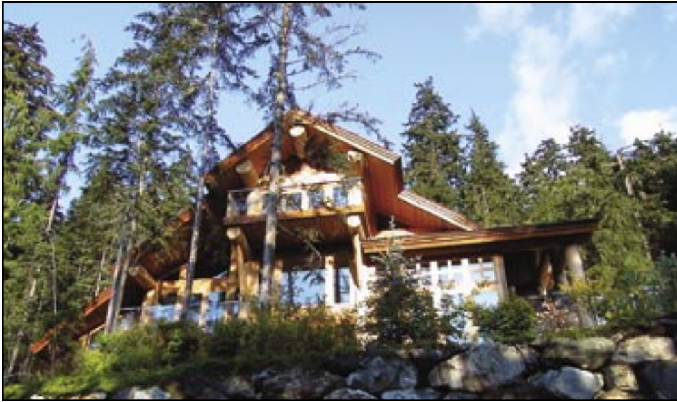
Canadian Building Restoration Products Inc.