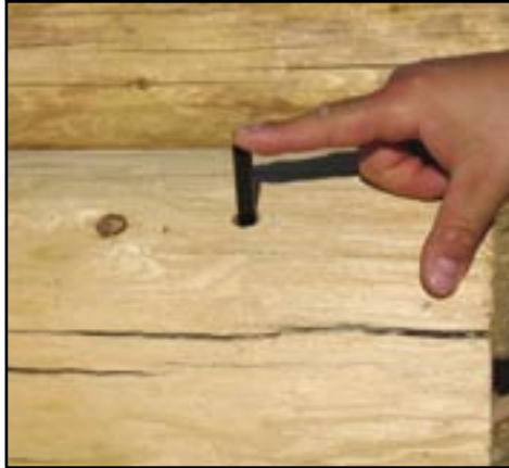
Genics Inc. and M&H Wood Specialties

Also useful for log homes are fused borate rods and borate paste. The rods are inserted into pre-drilled holes in parts of logs that are anticipated to get wet. When the wood reaches adequate moisture content, the rods slowly dissolve and the preservative diffuses through the wet part of the log. Borate rods and borate-glycol mixtures can also be useful for log restoration and