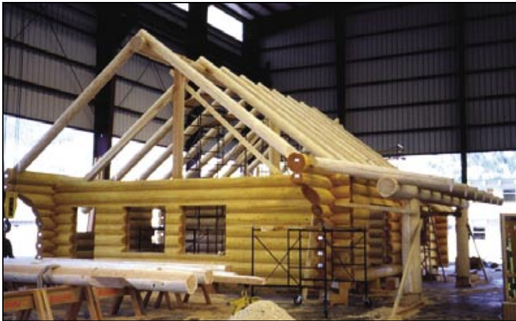
Unique Timber Corp.

If logs in storage are at risk for mold growth, they should be treated with a sapstain control product approved for use on logs - see the section on log treatment. If logs start to discolor from mold, they can be pressure-washed. As the logs dry down during seasoning, they will be less likely to support mold growth.